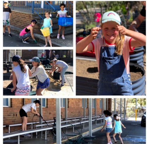
rubbish collection, sand worm and water play