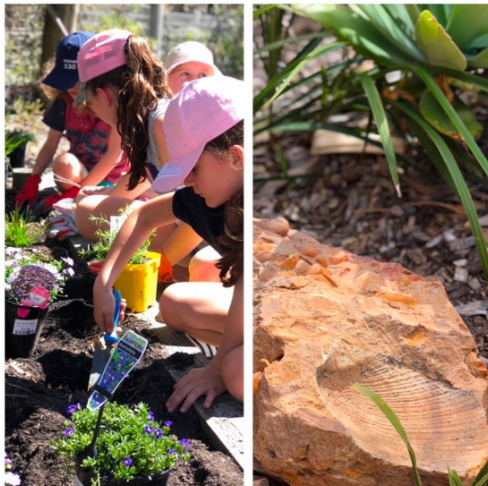
fossilised rocks in the garden and the planting