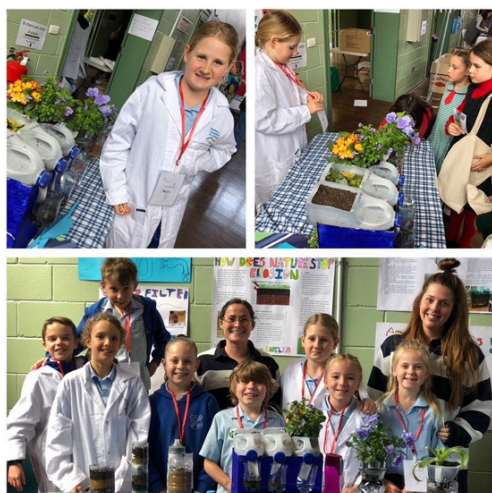
Students demonstrating aquaponics and solving erosion through vegetation