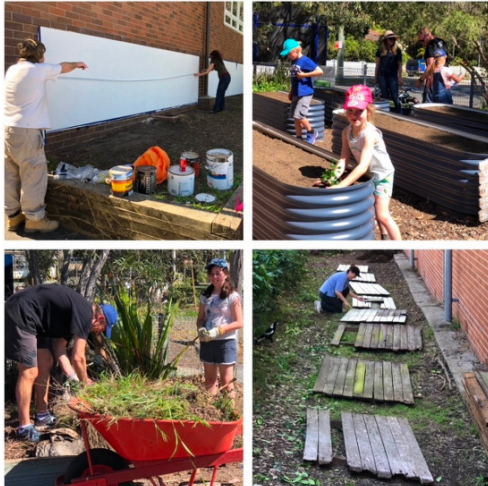
Every little bit of help at our working bee made a big difference