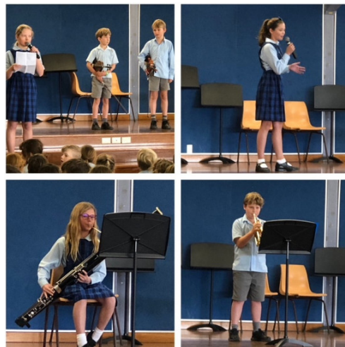
Just some of the stars from our 2018 Young Musicians showcase of talent

Congratulations to all of our musicians who performed as a part of our showcase last week – you are super talented and possess some of the skills that will assist you to be successful in life; committed, persistent, reliable, self-disciplined and collaborative.