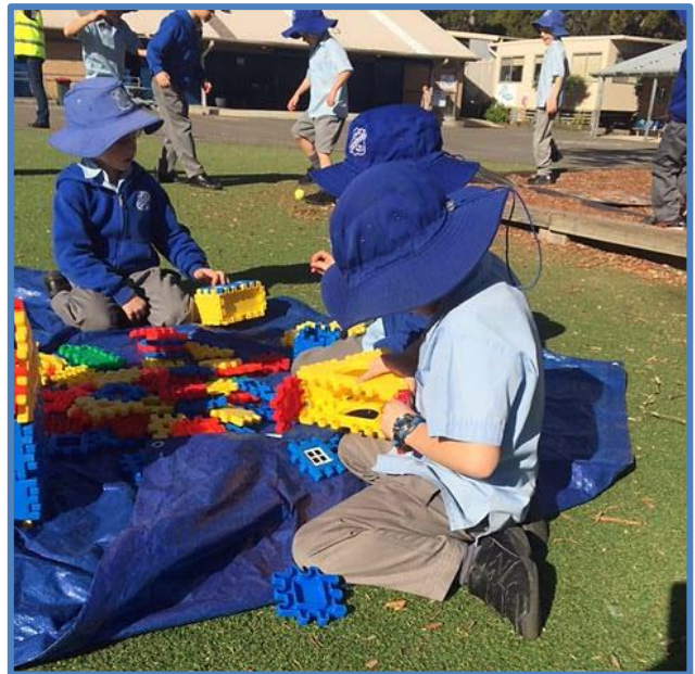
Fun in the winter sun on the western playground