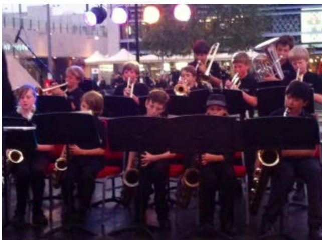
A view of some of the Stage Band on the Concourse at Chatswood

Finally, thank you to the Newport PB and SB musicians from all of us - parents, committee members, conductors - YOU WERE AMAZING! Jude Knott