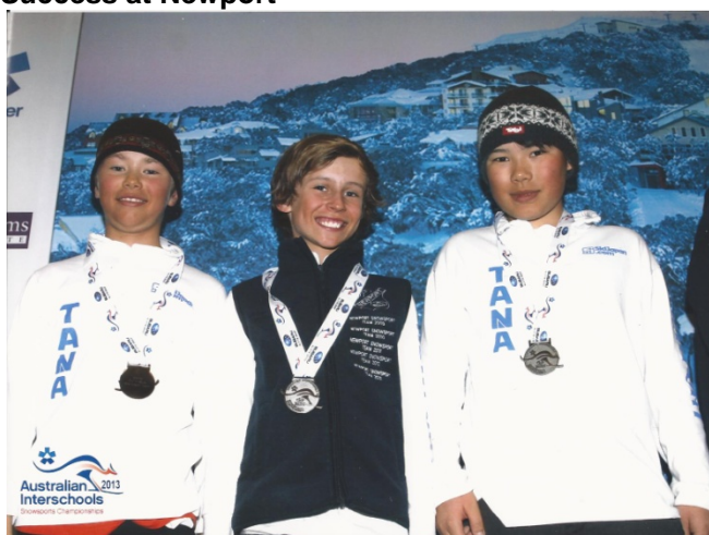
Winners are grinners! Division 4 Boys win the Skier X and runner up in Alpine.