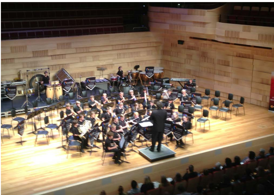
Newport Performance Band on stage at the Chatswood Concourse Concert Hall