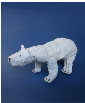
“Polar Bear” by Charlie Belic Media: Paper and Plaster of Paris