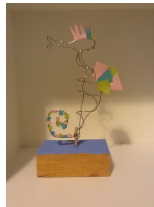
“Seahorse” by Charlie Belic Media: Paper and wire