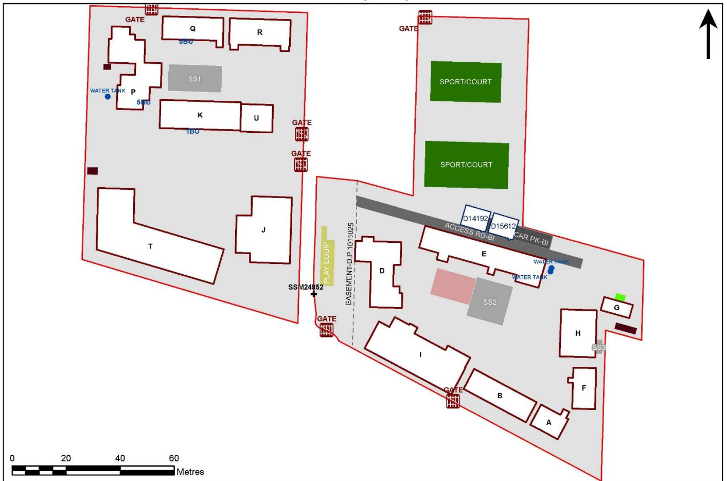
2740 - Newport Public School Site Plan (All Sites)